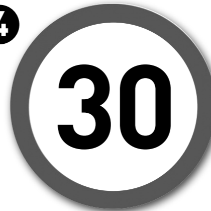
Maximum speed limit