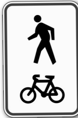
Shared path for walking and cycling