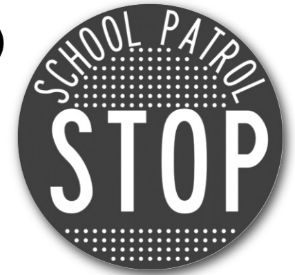
School crossing patrol