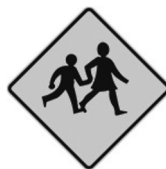
Look out for children