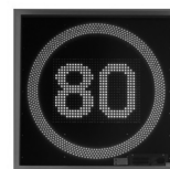
Variable speed limit